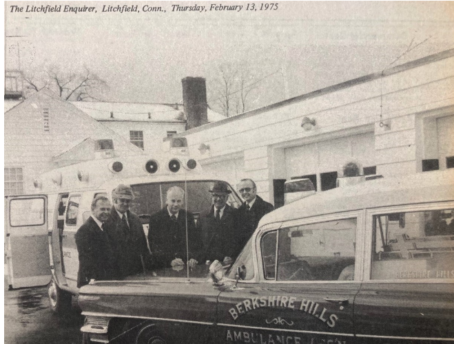
The Litchfield Enquirer, Litchfield, Conn., Thursday, February 13, 1975